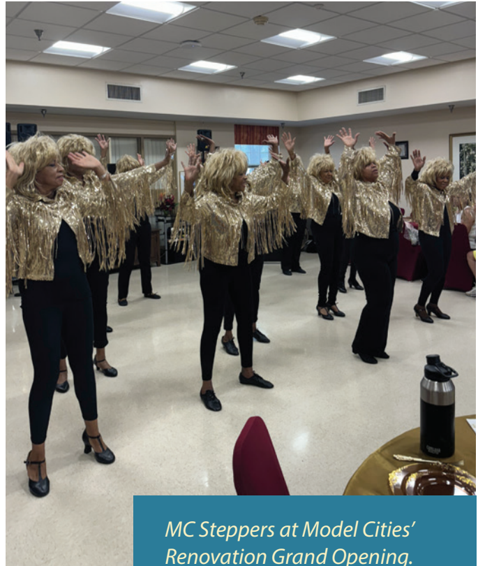
MC Steppers at Model Cities' Renovation Grand Opening.

Model Cities connects people to resources and each other. It can get lonely as people age and friends and family are not always close by. Members come to Model Cities to stay engaged and make new friends, helping each other live life to the fullest. We are excited to celebrate renovations to the Center that include a new dance studio, expanded parking lot, and new conference room for community meetings. And we are especially excited for grants from The Washington Home Foundation and AARP DC that provided more transportation to bring members to Model Cities!